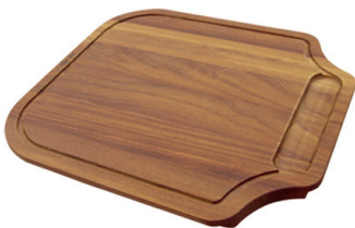
Iroko-wood chopping board 8655 000