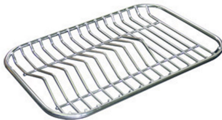
Stainless steel plate rack 8100 280