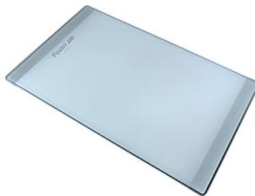
Glass chopping board 8631 300